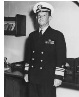
Frank Jack Fletcher , commander of U.S. Task Force 17