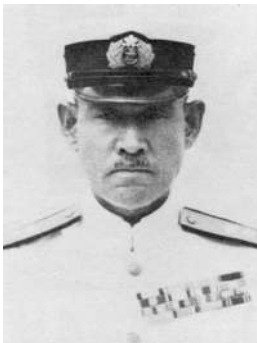
Shigeyoshi Inoue , commander of the Fourth Fleet of the Imperial Japanese Navy

Both sides having suffered heavy aircraft losses and carriers sunk or damaged, the two forces disengaged and retired from the area. Because of the loss of carrier air cover, Inoue also recalled the Port Moresby invasion fleet. Although the battle was a tactical victory for the Japanese in terms of ships sunk, it has been described as a strategic victory for the Allies. The battle marked the first time since the start of the war that a major Japanese advance had been turned back. More importantly, the damage to Shōkaku and the aircraft losses of Zuikaku prevented both ships from participating in the Battle of Midway the following month.