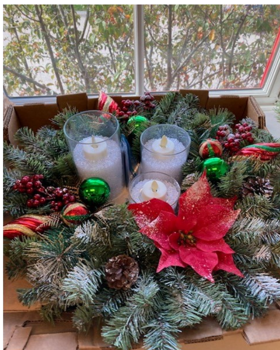
Nashua VFW Post 483's entry into the Lions Club Festival of Wreaths, Table Top Trees and Centerpieces contest held at the Nashua Senior Center on Friday and Saturday, December 1 & 2, 2023.